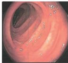
Excellent Bowel Preparation